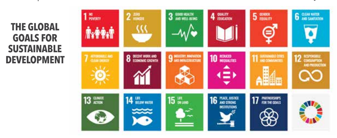
Figure 1: The Global Goals for Sustainable Development

The United Nations Sustainable Development Goals (SDGs) were adopted by the United Nations in 2015 as a universal call to action to end poverty, protect the planet, and ensure that by 2030 all people enjoy peace and prosperity. The 17 SDGs which are set out below are integrated—they recognize that action in one area will affect outcomes in others, and that development must balance social, economic and environmental sustainability.