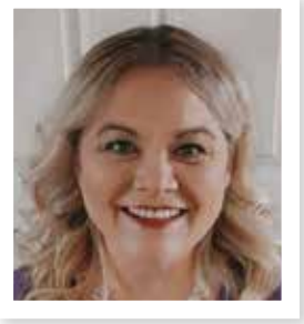
ATU Sligo - Chairperson of ATU Disability and Inclusion Sports